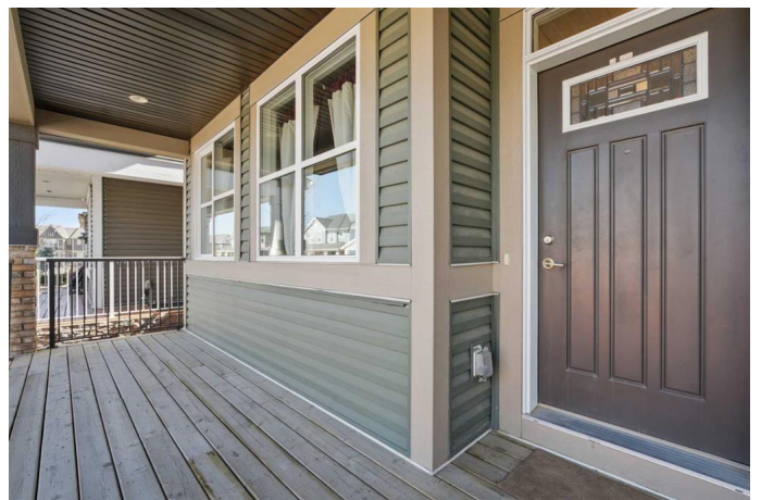
41 Legacy Glen Row SE, Calgary, AB

Main Floor Exterior Area 758.08 sq ft Interior Area 691.29 sq ft